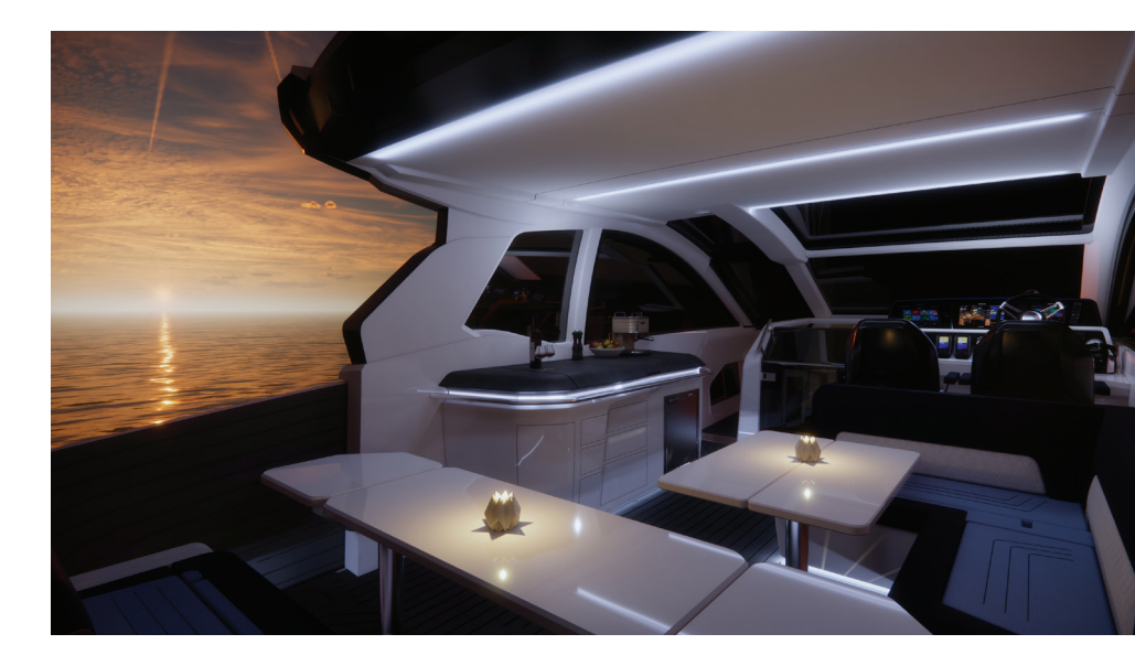
An enclosed, spacious helm offers protection from the elements with an outdoor area protected by an electric awning.