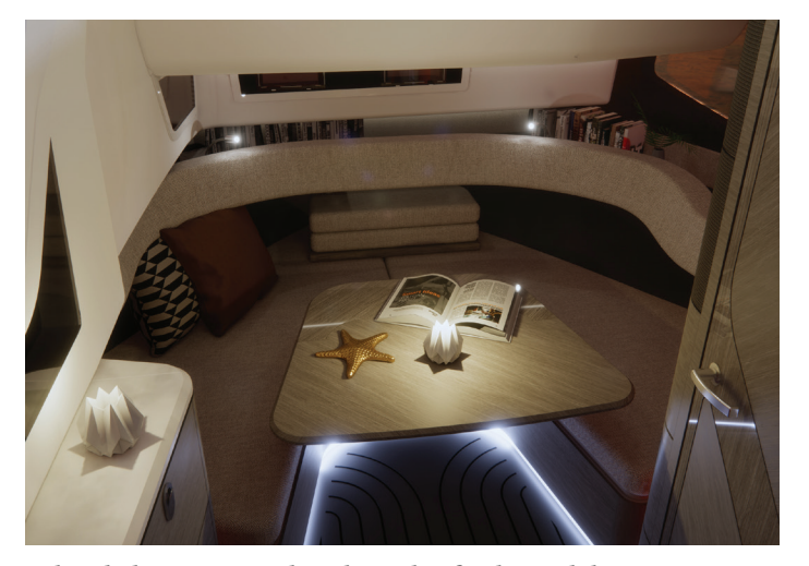
Below deck impresses with yacht quality finishes and sleeps 4, making this and enviable choice for an overnight excursion.