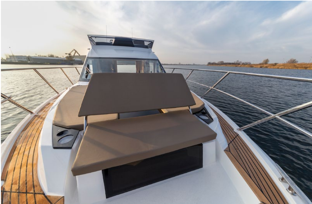
— Prop up the bow seat for a thrilling ride