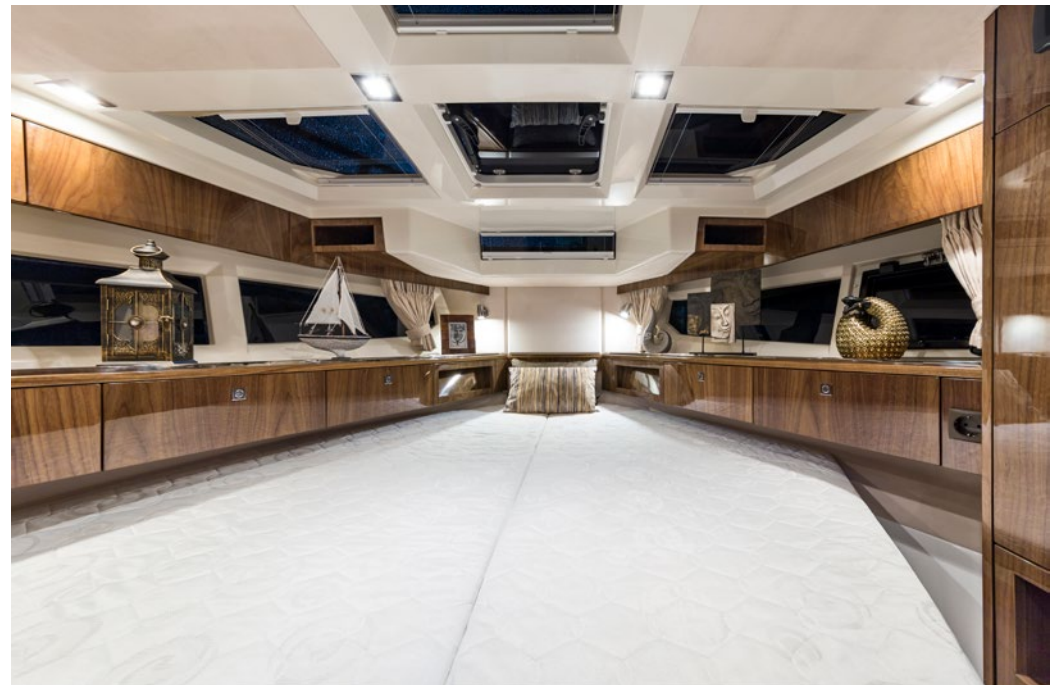
The forward cabin holds a double bed and extra storage —