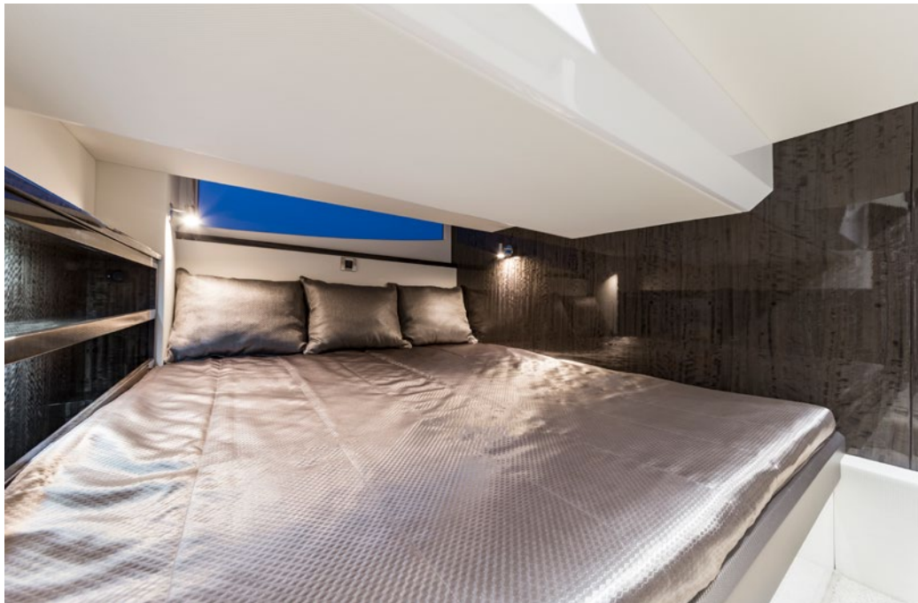
A large bed in the guest cabin down below