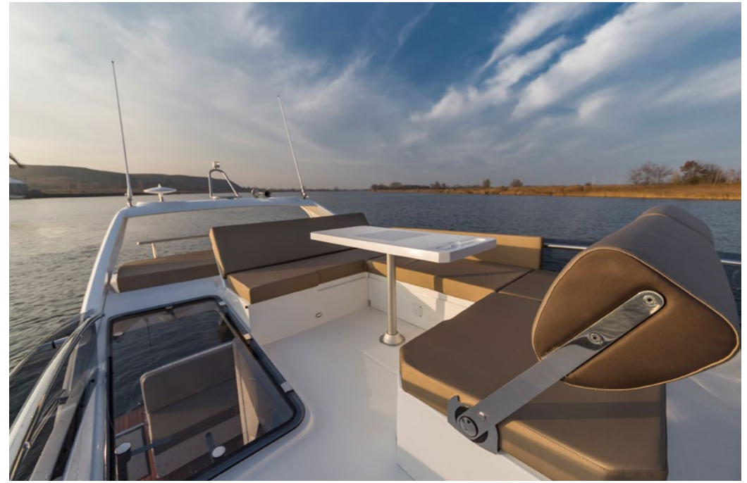
— Plenty of space for activities and leisure