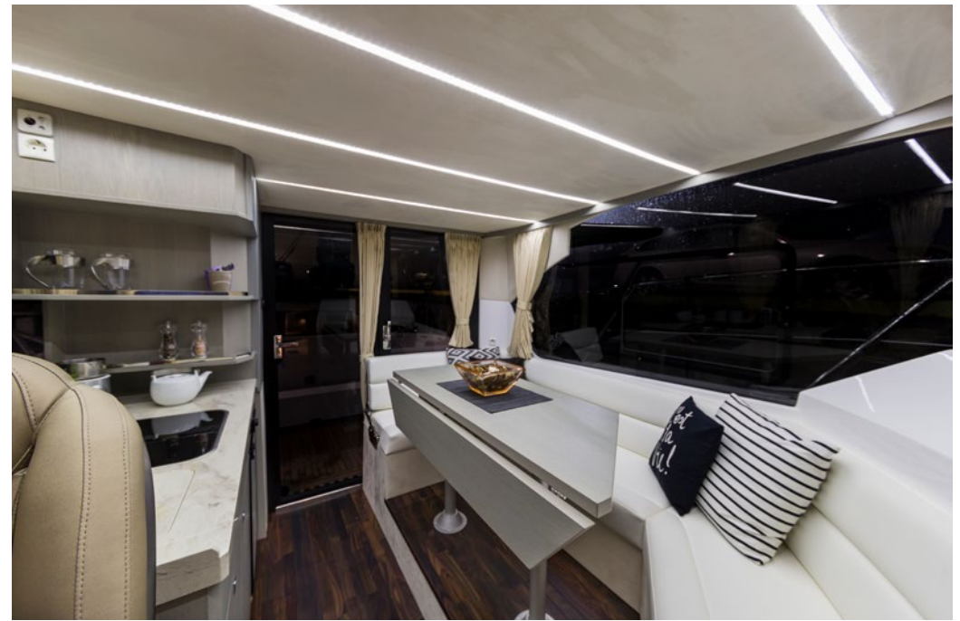
— The table can be propped up for extra dining space