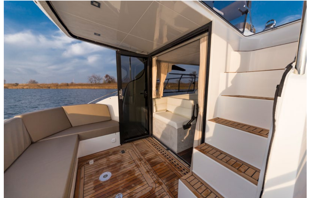
— The cockpit offers easy access to the saloon and flybridge areas