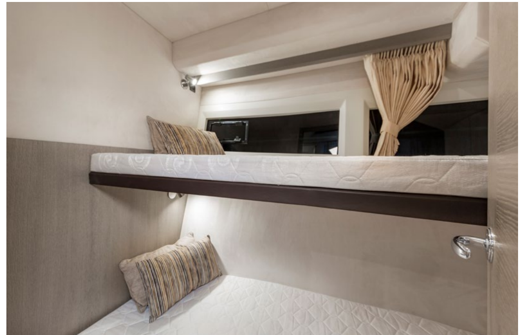
— Bunk beds in the guest cabin down below