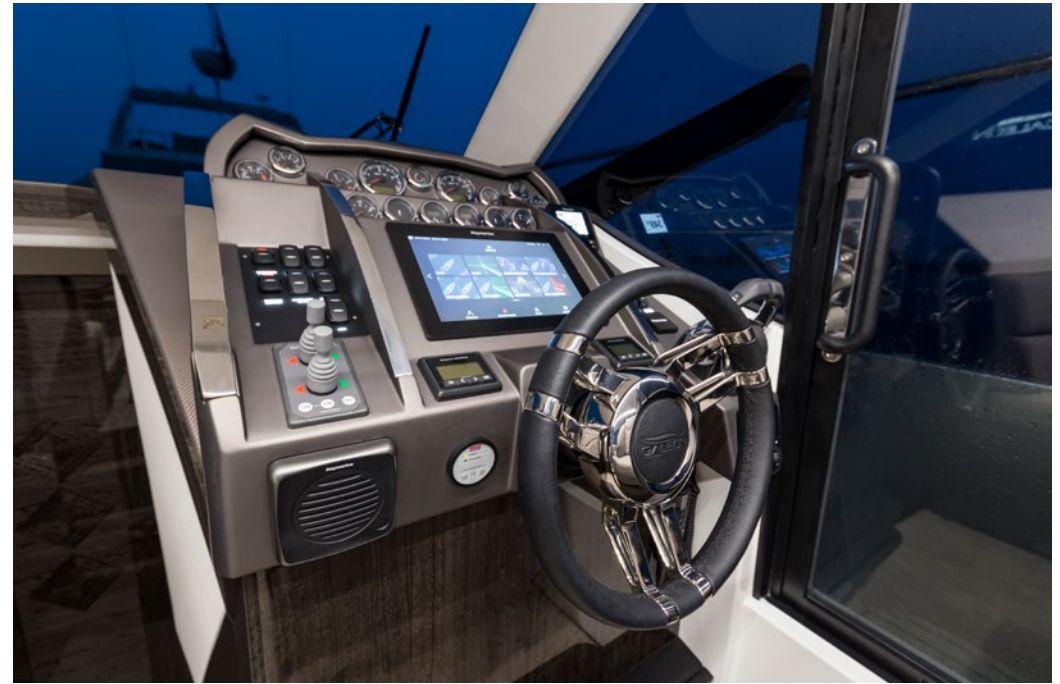
Great visibility and control from the helm