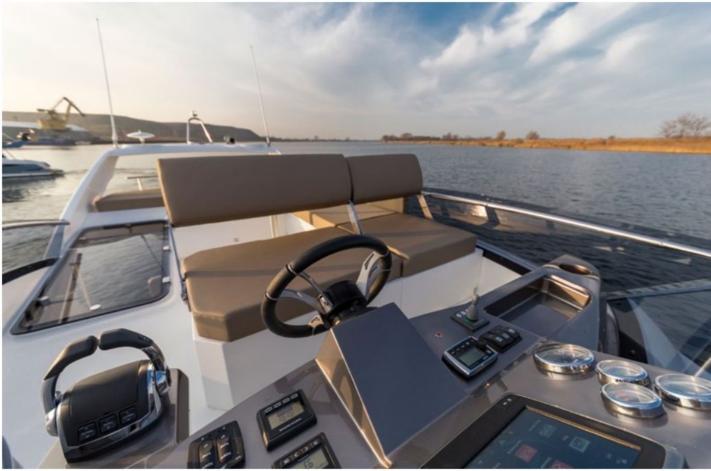
— Double seat at the helm station above