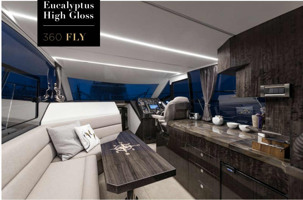
A custom high gloss design shows off the yacht's features