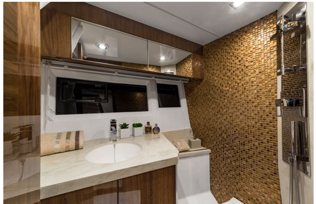
The bathroom comes fitted with a head and a shower —