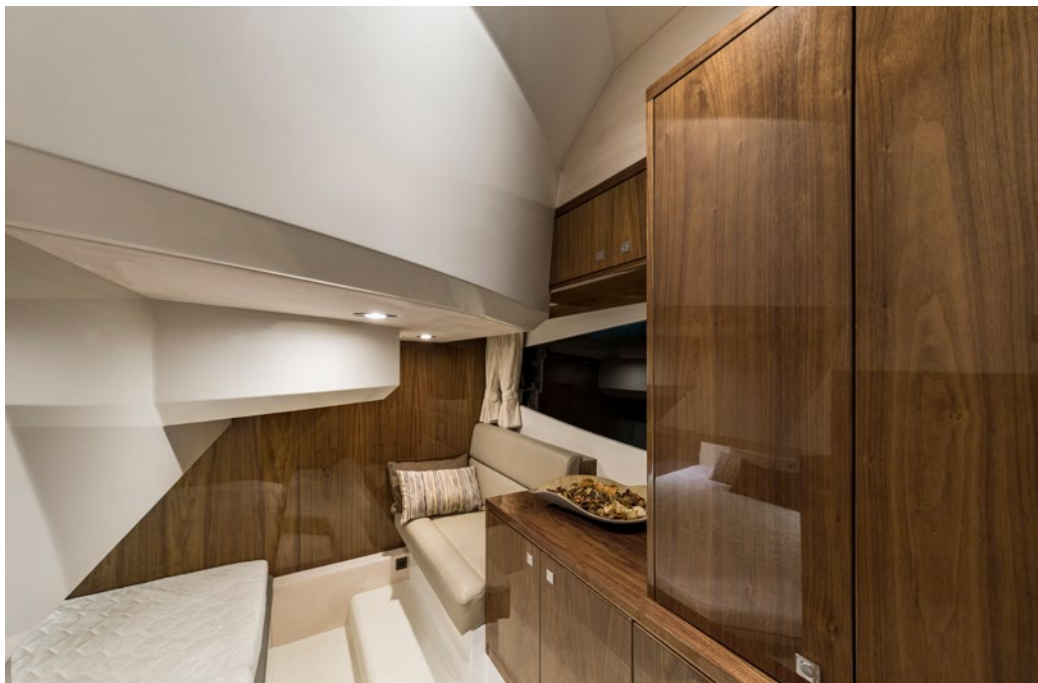
The guest bedroom comes with a large double bed —