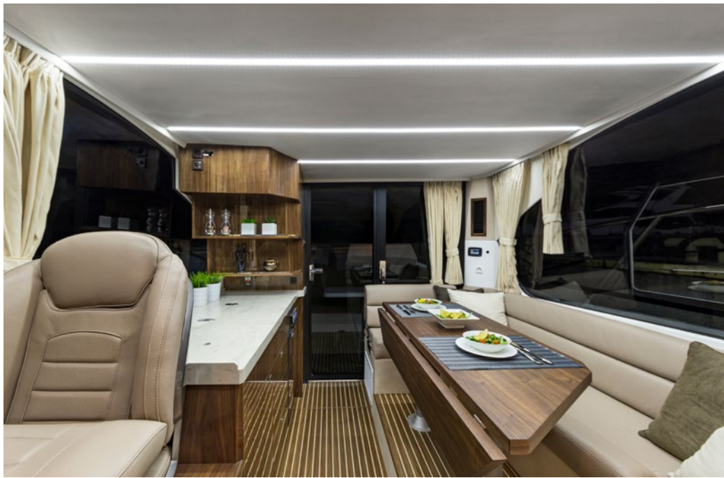
Find a galley and a dinette in the saloon —