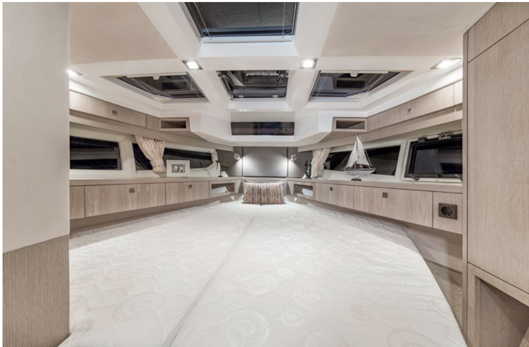
— The main cabin has an abundance of windows and skylights