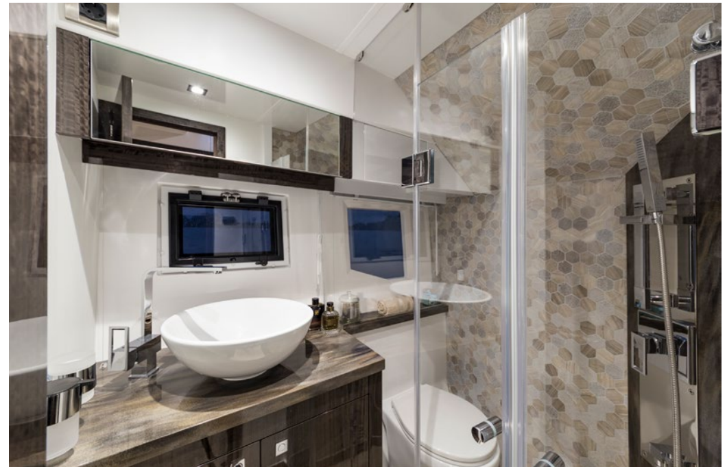
A quality finish and a separate shower will please the guests