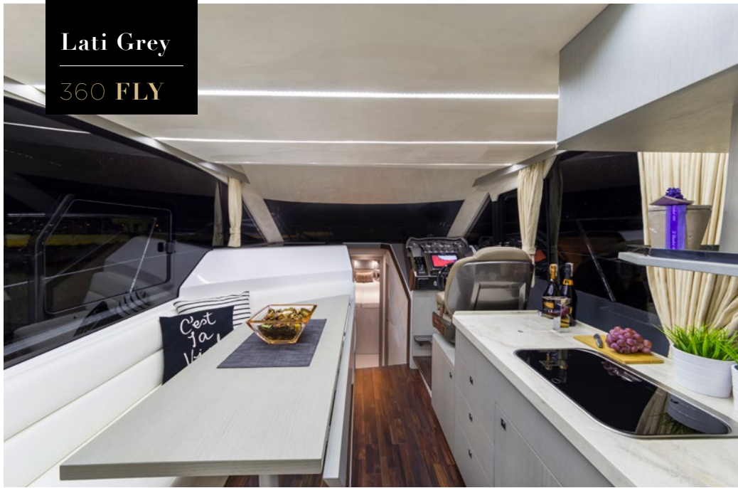
— Find extra storage space all around the main cabin